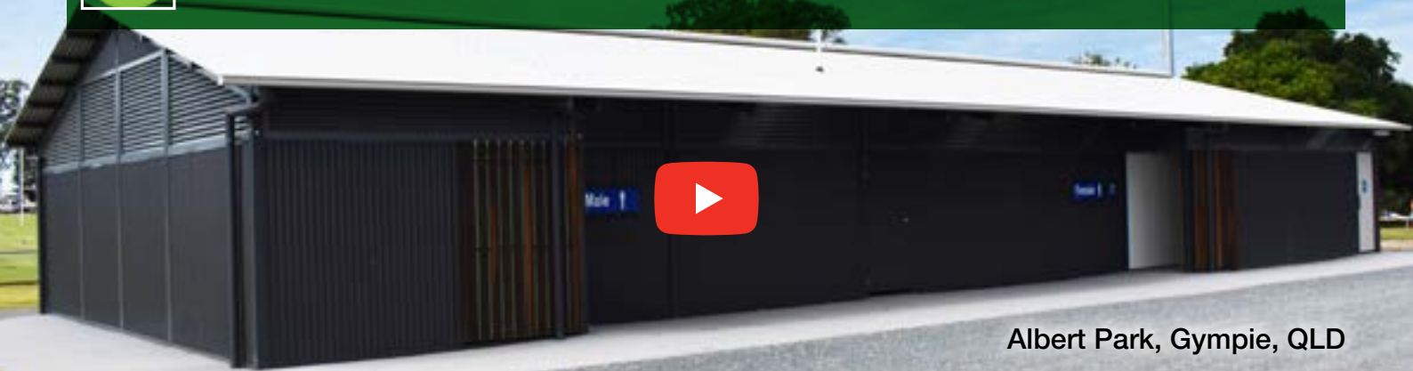
Albert Park, Gympie, QLD

The modified K8105 Sports and Recreation facility includes: