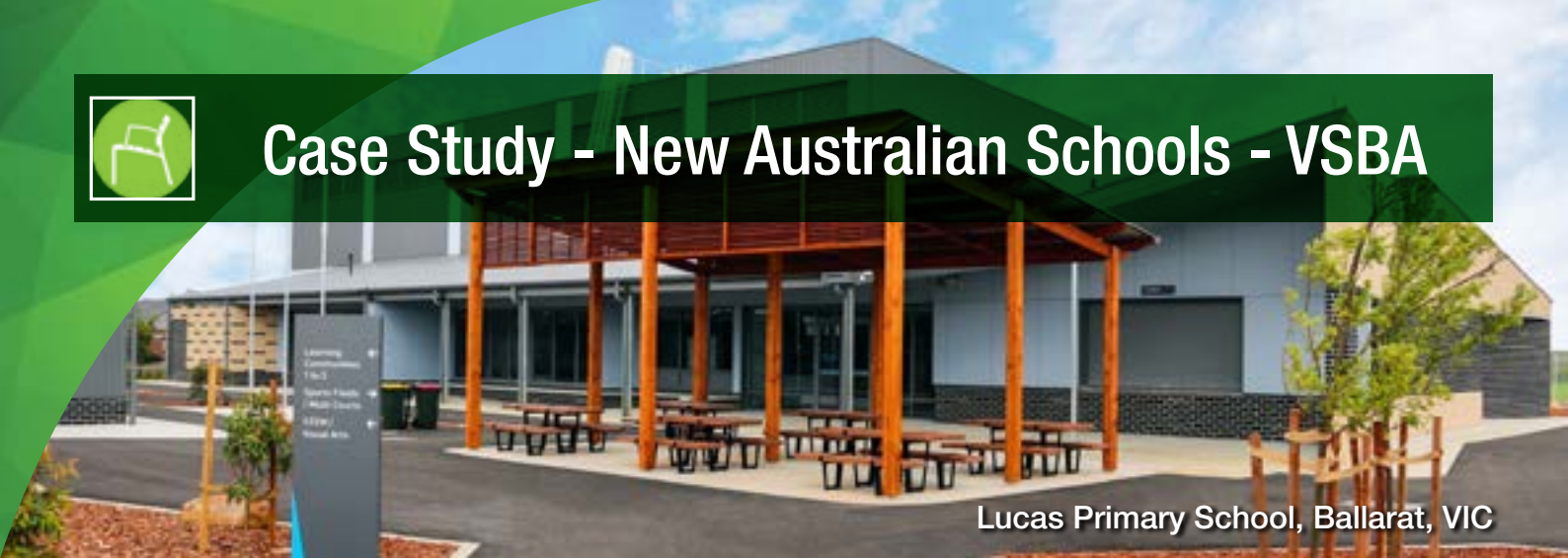
Lucas Primary School, Ballarat, VIC

Furphy Foundry and Landmark Products supplied the following infrastructure as part of 8 brand new school builds (including Clyde North, Craigieburn South, Beveridge West, Botanic Ridge, Casey Fields, Lucas (Ballarat) and Wyndham South (Riverwalk) Primary Schools) in the state of Victoria. This major project utilises over 180 years' experience at Furphy Foundry and Landmark Products combined.